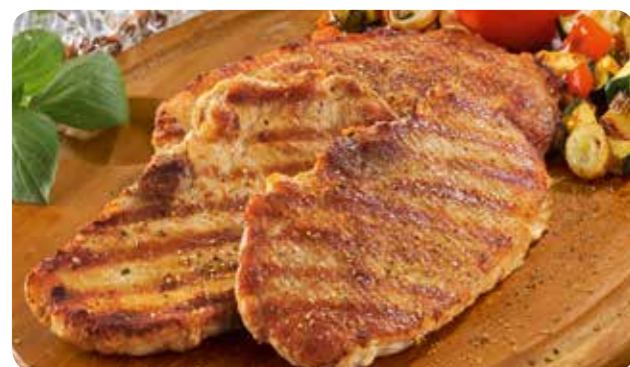
Pork topside steak, uncooked, neutrally seasoned, I.Q.F. deep-frozen, 160 g

Made from pork tenderloin or shoulder, or even with ham, it's pure meat heaven!