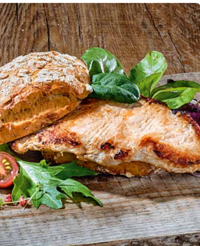
Pork fillet steak, fried, neutrally seasoned, I.Q.F. deep-frozen

Fresh pork fillets refined into steaks and fried fat-free on both sides until golden-brown, I.Q.F., loosely packaged